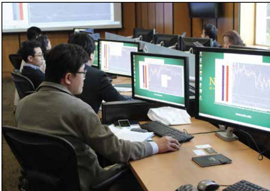
A highlight of the course was training in the electronic Commodity Trading Room (CTR), at NDSU’s downtown campus. In this laboratory, students learn how to extract and analyze information, and then make decisions with respect to risk management.