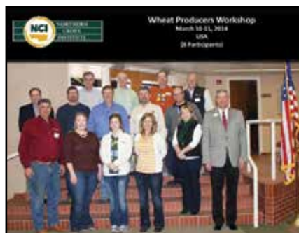
Participants of the Wheat Producers Workshop presented in March 2014

producer, I'm thinking yield. Bakers are thinking quality. Wheat quality is very complex. At this workshop, I learned more about what quality means to bakers and millers in terms of testing, and how that information translates to a good finished product."