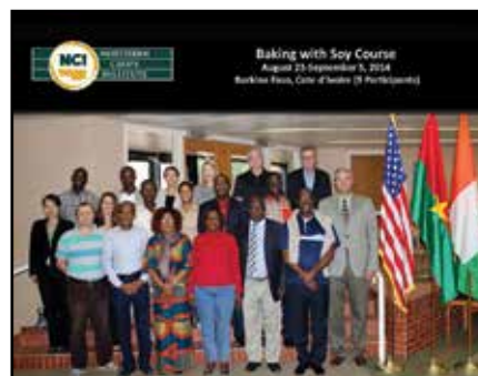
2014 Baking with Soy course participants from Burkina Faso and Cote d'Ivoire, Africa