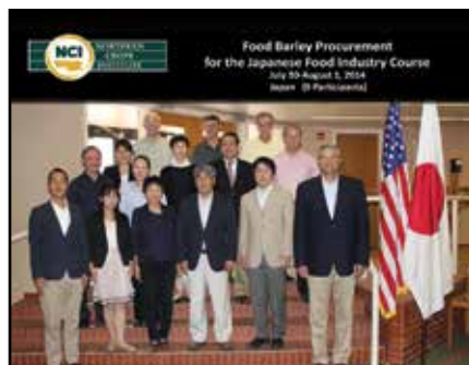
2014 Food Barley Procurement course participants