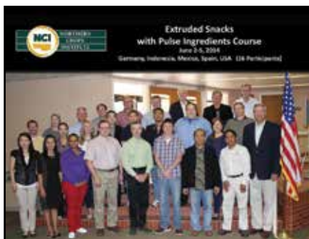
2014 Extruded Snacks with Pulse Ingredients course participants