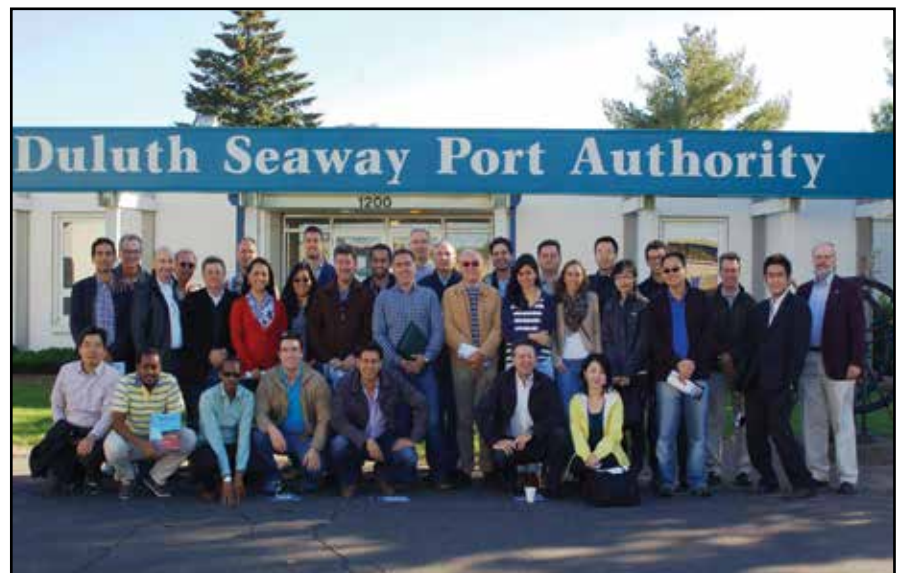
Each year, the course participants visit the Duluth-Superior Port Facilities in Duluth, Minn., where their staff provide an overview of the port's operations.