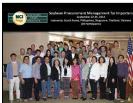
2014 Soybean Procurement Management for Importers course participants