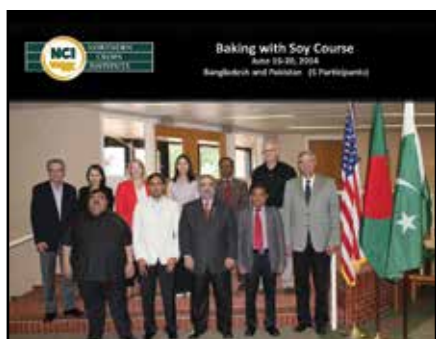
2014 Baking with Soy course participants from Pakistan and Bangladesh