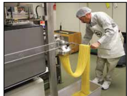
A pasta course participant catches a batch of pasta as it comes out of the pasta extruder.