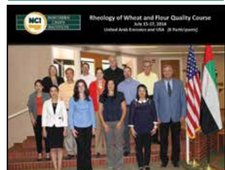
2014 Rheology of Wheat and Flour Quality course participants