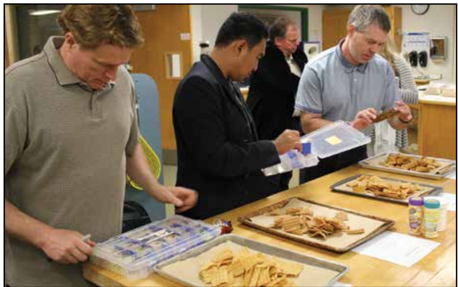
NCI staff prepared a large variety of extruded snack products before the course. After the course, participants were able to take a variety of samples back to their company.