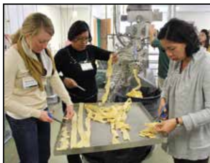
Participants assist with the preparation of extruded pulse snacks.