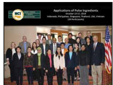
2014 Applications of Pulse Ingredients Workshop participants