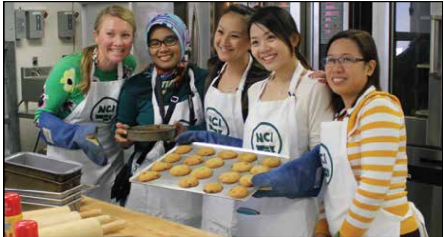
Participants in the Applications of Pulse Ingredients Course show off the snack products that they made during the class.

SK Food International hosted a tour of their pulse processing facility in Moorhead, Minn.