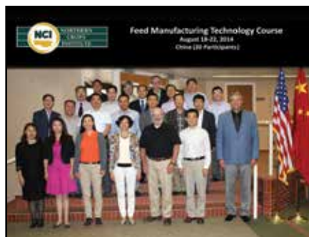
2014 Feed Manufacturing Technology course participants