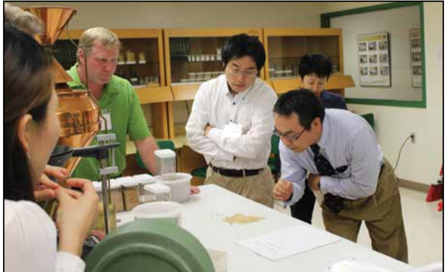
During the course, the Japanese Barley team spent time in the NCI Commodity Grading Laboratory learning about U.S. barley quality characteristics.

Participants also toured SB&B Foods, Inc, Casselton, N.D., and MGI Grain Processing, East Grand Forks, MN.