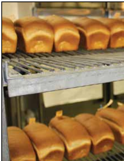
This soy-enhanced bread was made during the August Baking with Soy course.