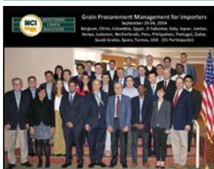
2014 Grain Procurement Management for Importers course participants