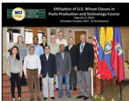
2014 Utilization of U.S. Wheat Classes in Pasta Production and Technology course participants