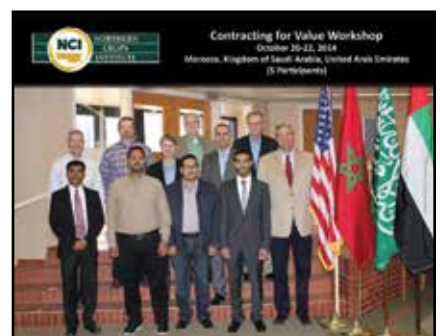
2014 Contracting for Wheat Value Workshop in October