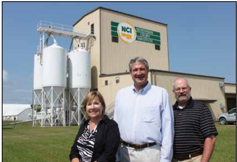
Feed Center see page 6