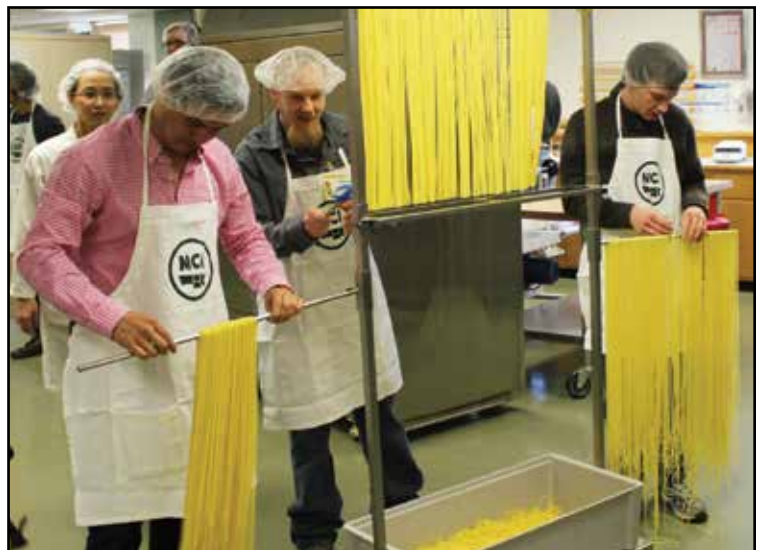
Pasta course participants prepare fresh pasta for the drying process.