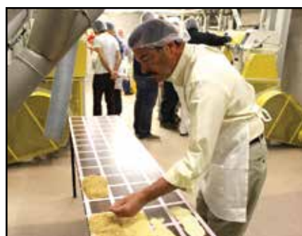
A participant examines the different samples of milled wheat.