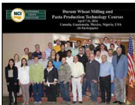
2014 Durum Wheat Milling and Pasta Production and Technology course participants